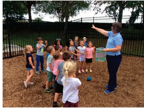
During the month of April, our VPK students studied the life cycle of a butterfly.