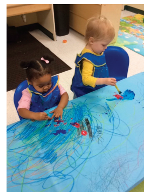
Our toddler students love sensory exploration!