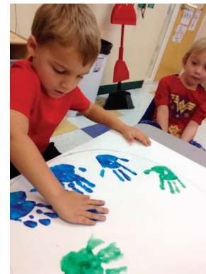
Our students participated in different activities discussing the importance of our earth in honor of Earth day this month.